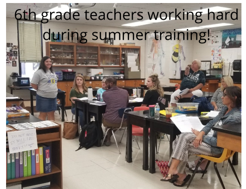
6th grade teachers working hard during summer training!

We want to celebrate the great learning we see taking place in your classrooms everyday! Throughout the school year, as you are teaching and your students are learning and exploring social studies, share with your colleagues the good things that are happening in your schools. Send us pictures of your students engaging in the Social Studies Practices, digging into primary and secondary sources, analyzing, justifying, debating, creating, and being social scientists! We see these things happening everyday as we are visiting schools and classrooms-let your fellow social studies teacher share in your students' successes!